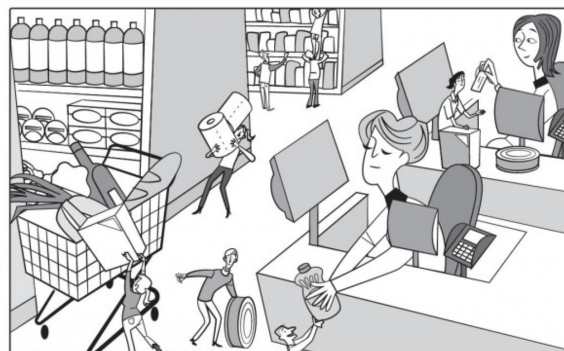
There were very little people in the supermarket this morning.