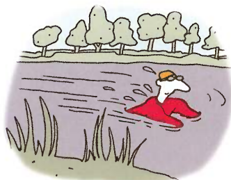
4 Pedro ..... in a river.