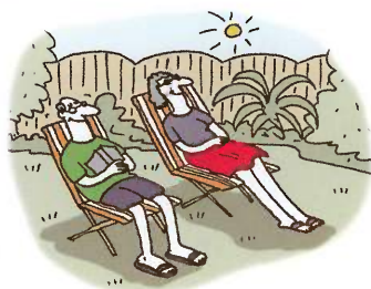
1 They ..... in the garden.