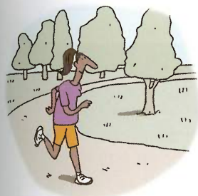
0 Susy 's running in the park.