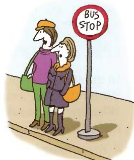
5 They ..... for a bus.