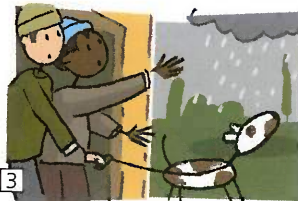
3 as soon as